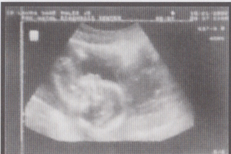
Once upon a time, we were the same.

One day, in the age of plastics & silicon breast implants, a fabulous boy-gyrrrl, named Finnochio was born.